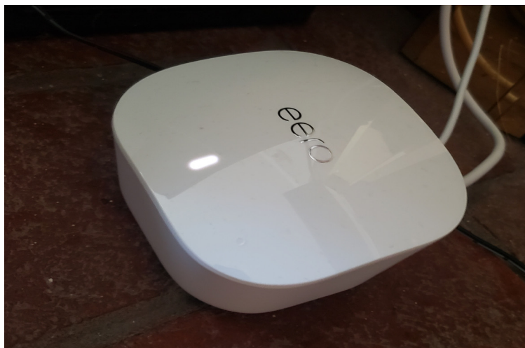
Danrick Ivan Jamora

The most obvious step to speeding up your internet is having fewer people use it at the same time. Most internet bandwidth is measured in megabytes per second (mbps), and each family has a set speed depending upon the plan that your family purchased. But this speed is